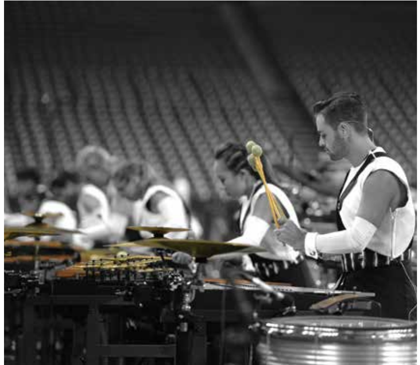
THE BLUE DEVILS , Concord, CA